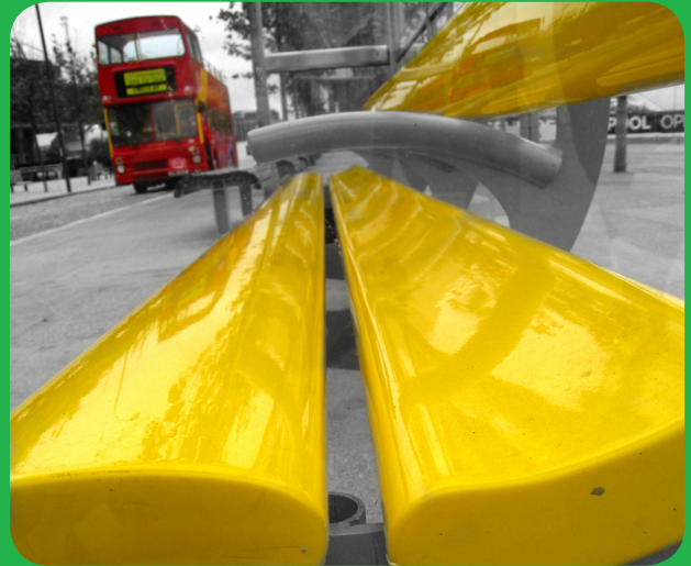
Yellow bus stop

Inclusive Mobility 1 advises that, wherever possible, seats should be provided at bus stops; adjacent to, but not obstructing, the pedestrian route and with sufficient space left for a wheelchair. Guidance on height ranges from a median of 470-480mm for conventional seating through 550-600mm for space-saving, fold-down models, to 700mm for 'perches', which some people with a disability prefer. Where space permits, a combination of seats at different levels is ideal (thus accommodating children and people of restricted growth), but armrests should be used with consistency; either provided for each seat, or not at all. Most sources of UK guidance stress that contrasting colours should be used, with slatted wood and plastic coated metal cited by one source 7 as providing warm, non-slip surfaces which are easy to clean and (in exposed positions) quick to dry.